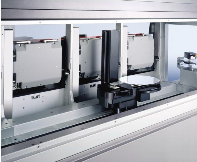
Design Innovation: The Spartan EFEM is one-half the volume of other tools of its kind and utilizes a high throughput dual end-effector Cartesian robot with optional edge grip aligners.

Asyst engineers developed the Spartan EFEM to go beyond expectations and set new standards in the marketplace. The result is an EFEM that is one-half the volume of other tools of its kind. Essentially, the EFEM must meet SEMI standards for equipment size to mount to an existing tool, but Asyst engineers were able to decrease the volume inside the Spartan EFEM, and completely remove the bottom portion of the tool. The result is an area under the Spartan EFEM that the end-user can utilize for their own tooling requirements and the overall weight of the Spartan EFEM is greatly reduced. In addition, the airflow system is highly optimized and efficient in large part due to less air volume to manage.